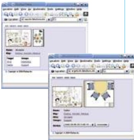
Ekahau Finder provides an easy-to-use interface for querying the locations of tracked devices.

Ekahau Finder is deployed on a server platform that runs the application, the application server, and the web server. You may choose to use the default application and web server that are delivered with the package, or deploy Ekahau Finder on an existing application and web server. In addition to Ekahau Finder you must have installed the Ekahau Positioning Engine, which provides the location information needed.